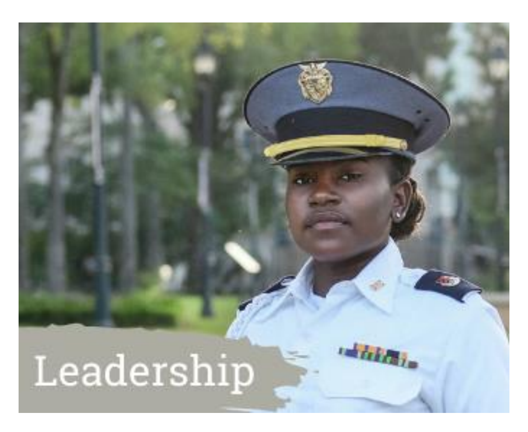
Develop leadership for the next generation

Students returning or transferring to GMC after a period of academic suspension are required to complete a workshop or seminar. Each campus has an individual designated to provide additional academic counseling and ensure that students returning or entering from suspension complete the training program.